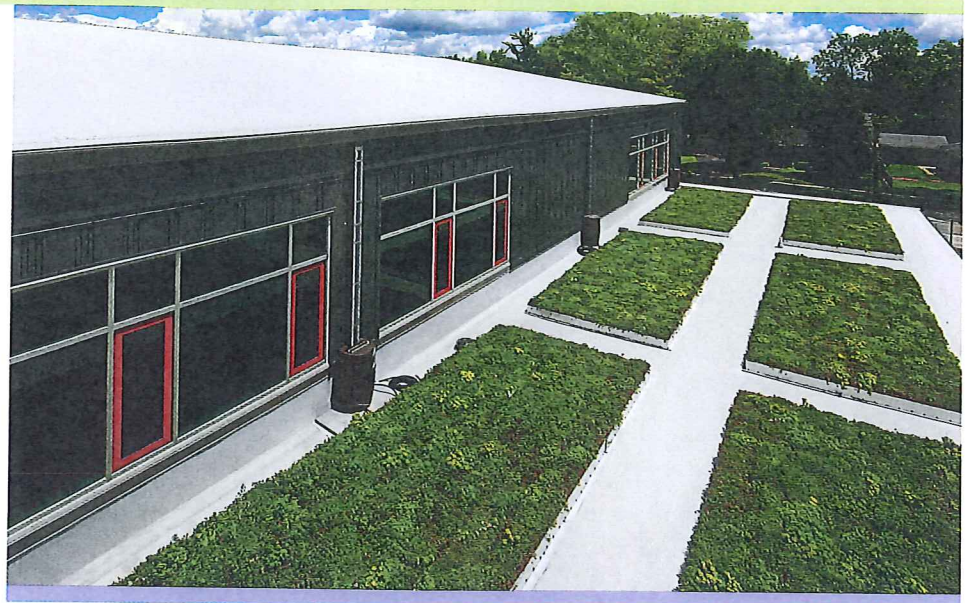
ABOVE The Lake Mills Elementary School features a green roof, which helps reduce rainwater run-off and improves the building’s insulation.

Perhaps most importantly, the school is proving that it is a healthy learning environment and the rate of absenteeism has been reduced. As studies show, absenteeism among teachers and students plays a signifi-