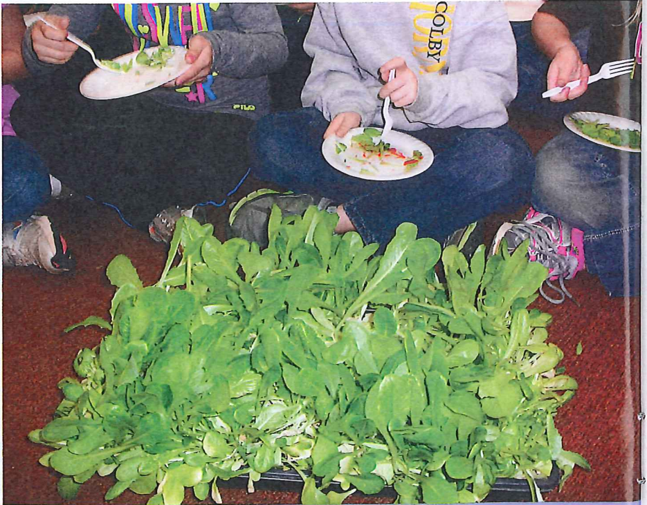
ABOVE LEFT Students from Colby Elementary School weed the school's raised beds. ABOVE RIGHT Students enjoy lettuce from the school's gardens.