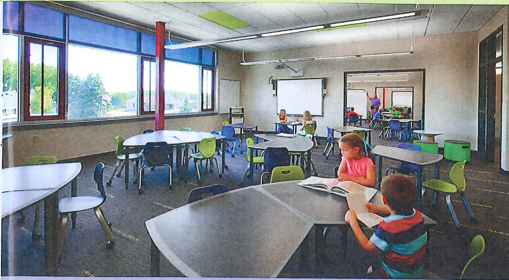
ABOVE The Lake Mills Elementary School is designed to maximize the use of natural light throughout the building.